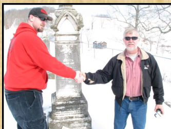
THE EDITURD & STONEÝ BEE

Put blackcurrant squash in first up to about 1cm in glass. Then add the lager and cider one after another.